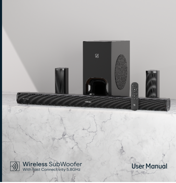
5.1 CH Dolby Audio Soundbar