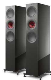
Titanium Gloss Special Edition (Exclusive for R7 Meta)