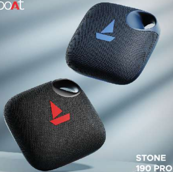
STONE 190 PRO